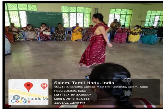
Salem, Tamil Nadu, India 190/179, Saradha College Main Rd, Fairlands, Salem, Tamil Nadu 636016, India Lat N 11° 40' 37.9056" Long E 78° 8' 52.5116" 12/03/21 12:40 PM