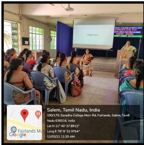
Salem, Tamil Nadu, India 190/179, Saradha College Main Rd, Fairlands, Salem, Tamil Nadu 636016, India Lat N 11° 40' 37.8912" Long E 78° 8' 52.9764" 12/03/21 11:30 AM