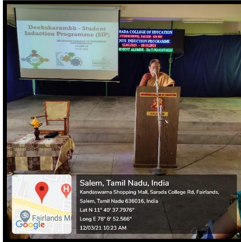
Salem, Tamil Nadu, India Kandaswara Shopping Mall, Sarada College Rd, Fairlands, Salem, Tamil Nadu 636016, India Lat N 11° 40' 37.7976" Long E 78° 8' 52.566" 12/03/21 10:23 AM