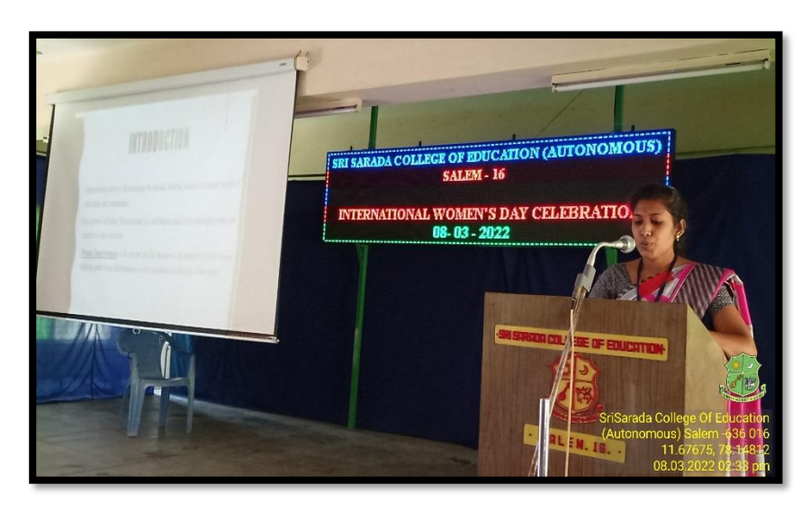
Sri Sarada College of Education (Autonomous), Salem – 636 016

Re-Accredited by NAAC with "A" Grade (III Cycle) Affiliated to Tamil Nadu Teachers Education University, Chennai