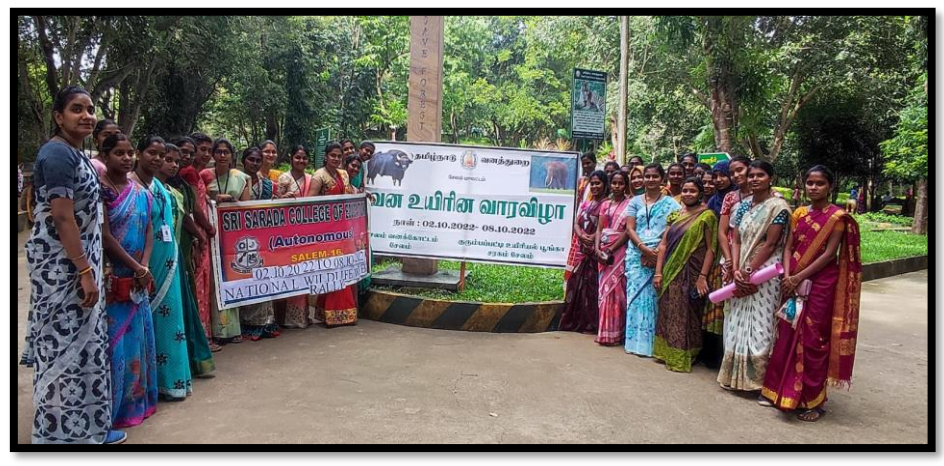
Sri Sarada College of Education (Autonomous), Salem — 636 016 Re-Accredited by NAAC with "A" Grade (III Cycle) Affiliated to Tamil Nadu Teachers Education University, Chennai