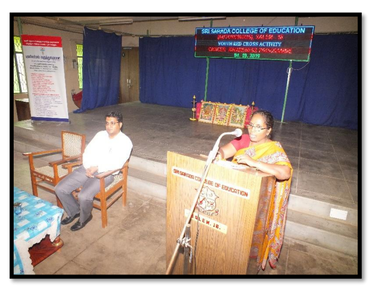
GUEST SPEECH ON CANCER AWARENESS