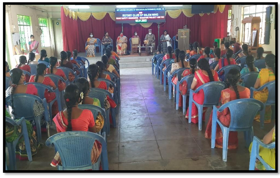
Sri Sarada College of Education (Autonomous), Salem – 636 016 Re-Accredited by NAAC with "A" Grade (III Cycle) Affiliated to Tamil Nadu Teachers Education University, Chennai