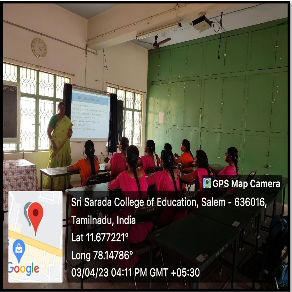
Sri Sarada College of Education (Autonomous), Salem – 636 016

Re-Accredited with 'A' Grade by NAAC (III Cycle) Affiliated to Tamil Nadu Teachers Education University, Chennai