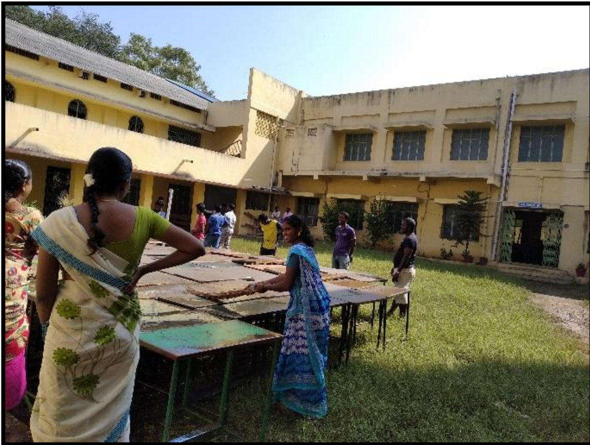
Sri Sarada College of Education (Autonomous), Salem – 636 016 Re-Accredited with 'A' Grade by NAAC (III Cycle) Affiliated to Tamil Nadu Teachers Education University, Chennai