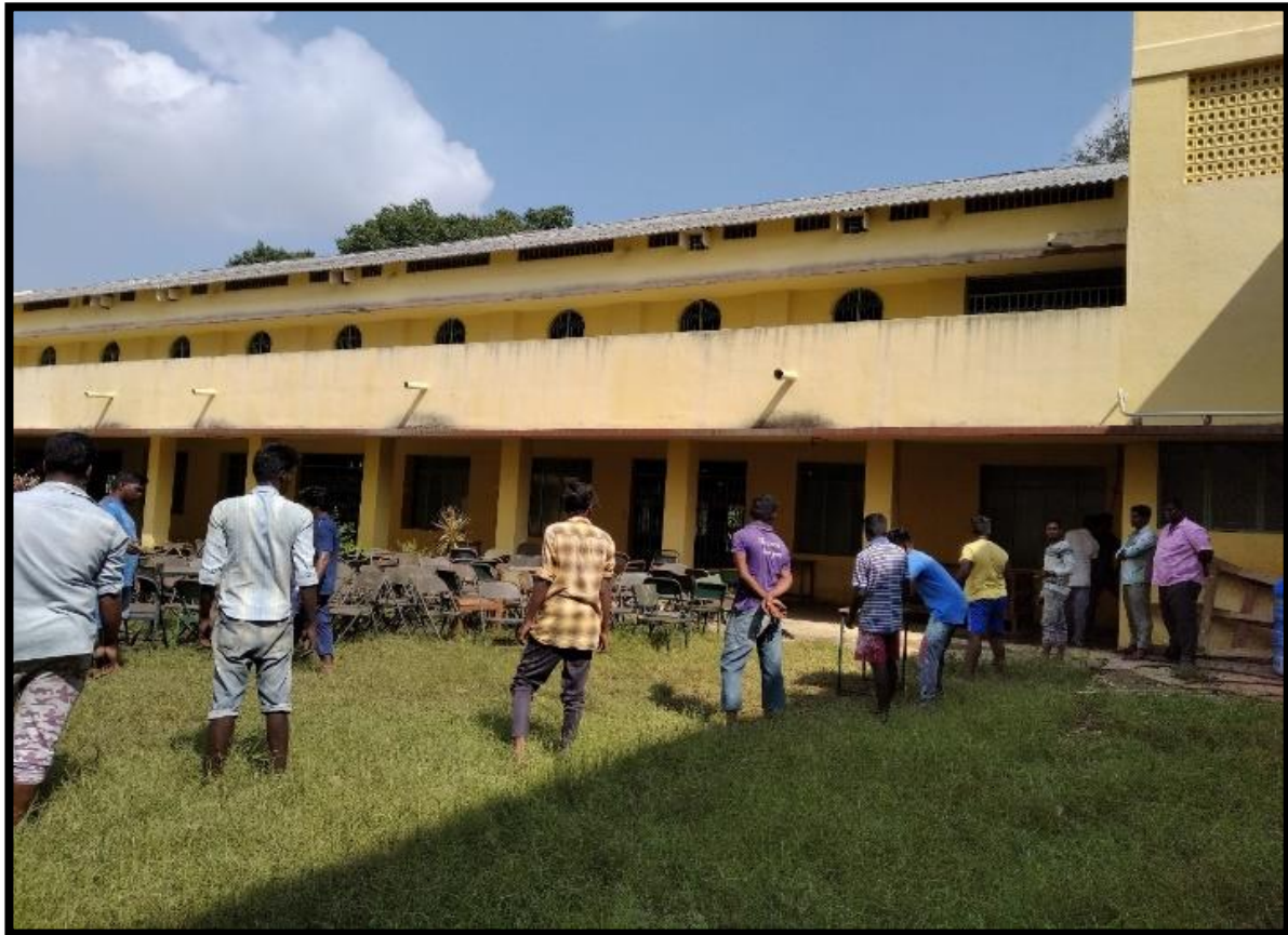
Sri Sarada College of Education (Autonomous), Salem – 636 016 Re-Accredited with 'A' Grade by NAAC (III Cycle) Affiliated to Tamil Nadu Teachers Education University, Chennai