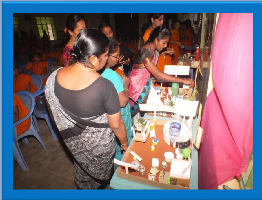
AWARENESS PROGRAMME ON BAN ON USE OF ONE TIME USE AND