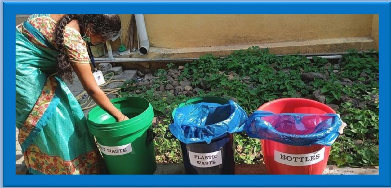
SEGREGATION OF WASTE